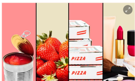
▲ From pesticides to phthalates, flame retardants to bisphenol (BPA) and PFAS, thousands of potentially harmful chemicals are in everyday products. Illustration: Guardian Design/The Guardian

Belgium seizes 778 tonnes of non-compliant phytosanitary products: Around 778 tonnes of non-compliant or suspect phytosanitary products from India and China have been seized in Antwerp by the Belgian Federal Agency for the Safety of the Food Chain (FASFC). Read here