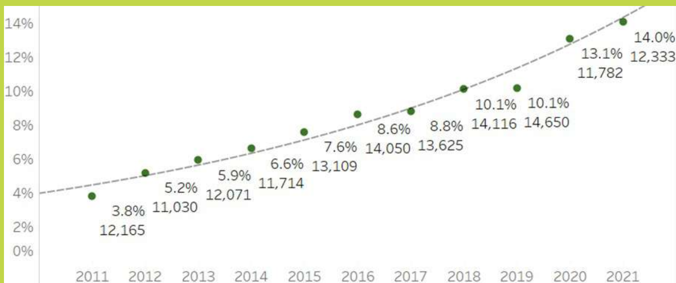
Figure 2. Average PFAS contamination in vegetables sampled in the EU in the period 2011-2021.