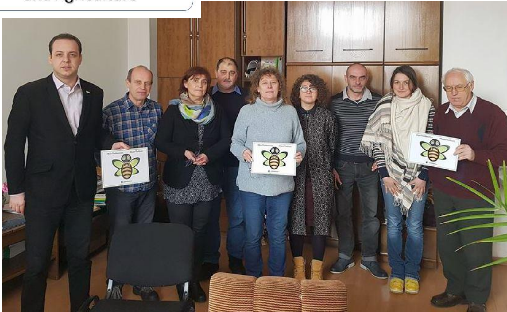
Agrarian Academy - workshop on neonics