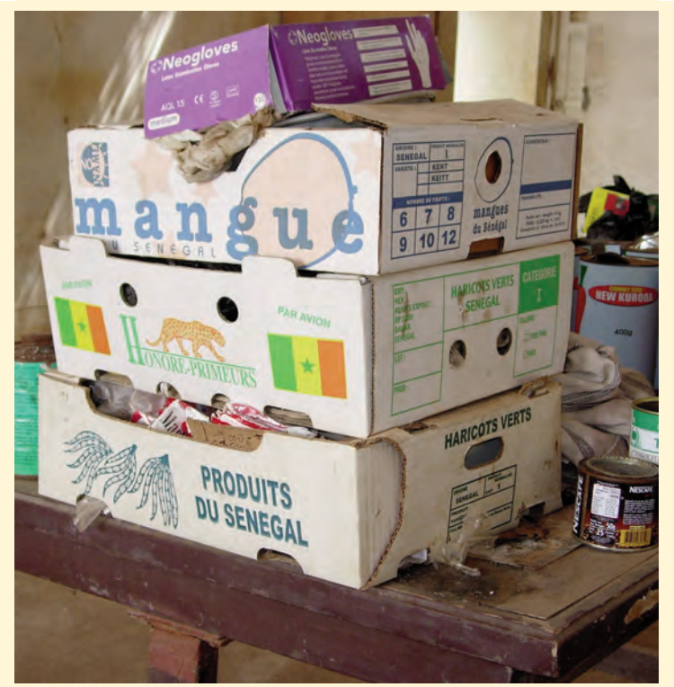
Up to date information on EU pesticide regulations is essential for all those involved in African export horticulture.

Most food companies in developed countries are now paying close attention to food safety issues, particularly pesticide residues in food. Maximum Residue Level (MRL) recommendations for pesticides are established globally by Codex Alimentarius, a joint FAO/WHO programme to protect