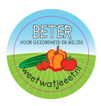
The 'Better for Health and Environment' logo identifies foods grown under low pesticide protocols

Farmers belonging to Dutch agricultural cooperative 'FrEsteem' have become the first agricultural producers in the Netherlands to market fruits and vegetables under the newly created 'Better for Health and Environment' label. Tomatoes carrying the logo hit supermarket shelves in October and were available to consumers shopping at C1000 supermarket.