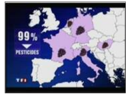
Ninety nine percent of grapes tested were shown to contain pesticides

The results also gave the first opportunity to assess the impact of new EU legislation introduced in September 2008 which substantially increased many of the maximum residue limits (MRLs) for