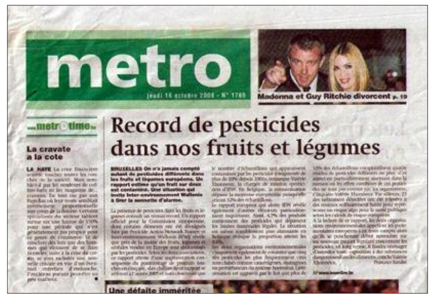
News of the record levels of pesticides in foods made front page headlines in Brussels