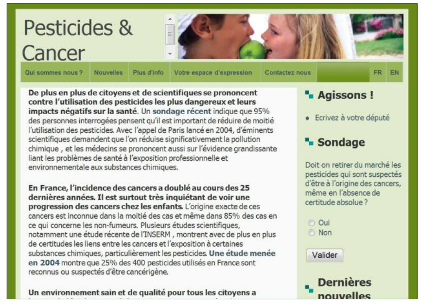
For more information on the campaign visit www.pesticidescancer.eu