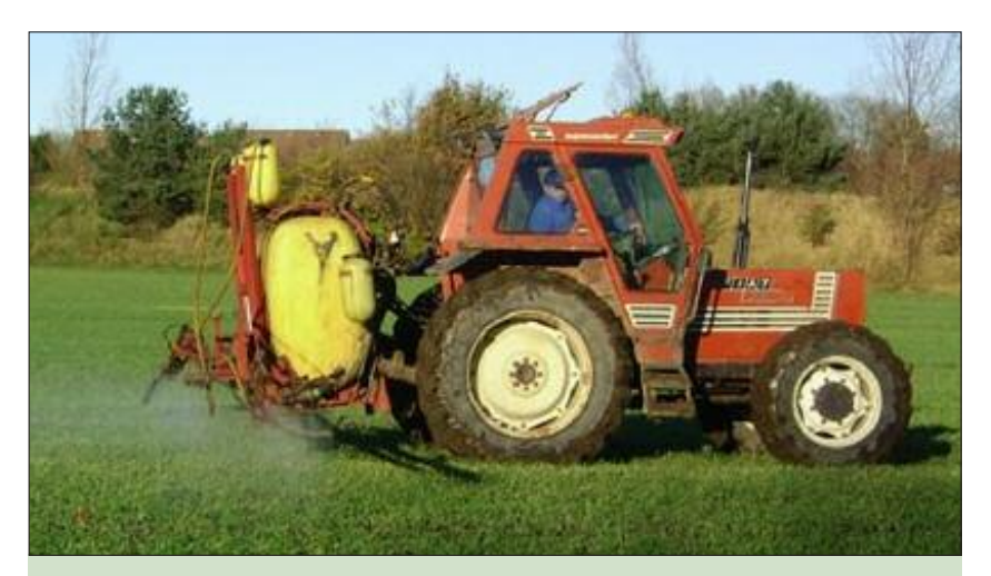
* The TFI expresses the average number of times per year agricultural land can be treated with the sold quantity of pesticides, assuming that the pesticides are used in the prescribed normal dosages. In Denmark the TFI is used as the most important indicator for the spraying intensity and the environmental load.