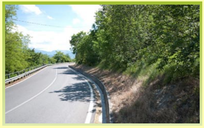
Fig. 6: Former orchid rich road-boarder damaged by the use of herbicides. Italy, Marche, Pesaro/ Urbino, SS 73bis, 5.6.2012.