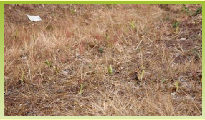
Fig. 8: Former orchid rich road-boarder damaged by the use of herbicides. Italy, Veneto, Vicenza, Colli berici, 2012, (fot. Daniele Doro).