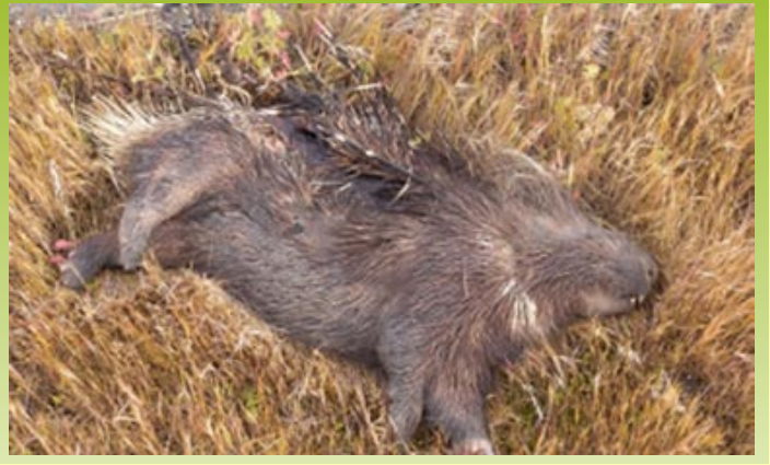
Fig. 12: Porcupine killed by a car along the Direttissima del Conero, april 2010, Ancona, Marche. On this boarder of the road shortly before were applied herbicides. The killed animal is a symbol for the irresponsible destruction of nature by the use of herbicides promoted by the authorities of the province of Ancona instead of promoting natur conservation by nature friendly methods within road-boarder management.

Fabio Taffetani, Accademia delle Erbe Spontanee