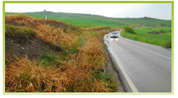
Fig. 1: Orchid rich road-boarder damaged by the use of herbicides. These boarders often represent the only refugia for plant and animal life in extended agricultural areas. Italy, Sicily, SS 121 km 176-177 ca 2 km W of Stazione Valledolmo, 3-5-2009. (fot. R. Lorenz).

years in order to avoid the proliferation of more aggressive herbs, which are now free to expand, after the disappearance of the vegetation that once covered the soil.