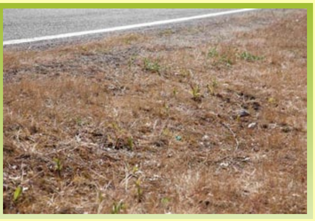
Fig. 10: Orchid rich road-boarder damaged by the use of herbicides. Italy, Sardinia, 2012.