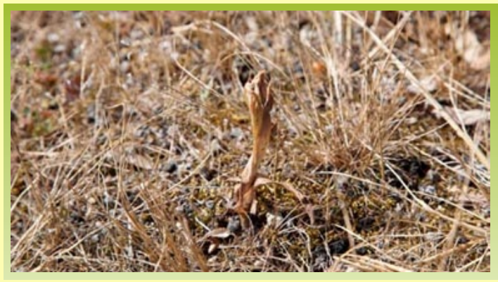
Fig. 11: Orchid damaged by the use of herbicides on road-boarder. Italy, Sardinia, 2012, (fot. Alessandra Manca)