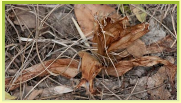
Fig. 7: Orchid damaged by the use of herbicides on road-boarder. Italy, Marche, Pesaro/Urbino, SS 73bis, 5.6.2012.