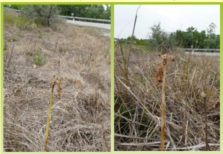
Fig. 4-5 Orchid rich road-boarder damaged by the use of herbicides. Italy, Molise, Isernia, SS 17 km 164, 2011, (fot. Rolando Romolini).

Fig. 2-3: Orchid rich road-boarder damaged by the use of herbicides. Italy, Molise, Isernia, SS 17 km 164, 2011 (fot. Rolando Romolini).