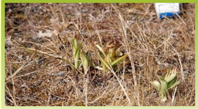
Fig. 9: Orchids damaged by the use of herbicides on road-boarder. Italy, Veneto, Vicenza, Colli berici, 2012, (fot. Daniele Doro).: